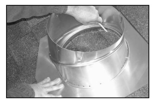
3.Using back of this page determine placement of turbine(s). Locate base opening between rafters and mark hole(s) to be cut. Locate rafters by tapping roof.