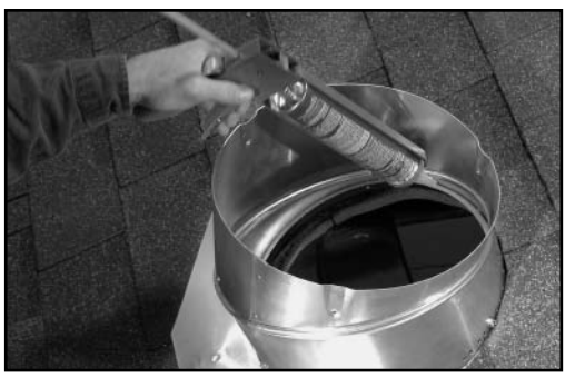
8.Seal all seams and nails with roofing cement.