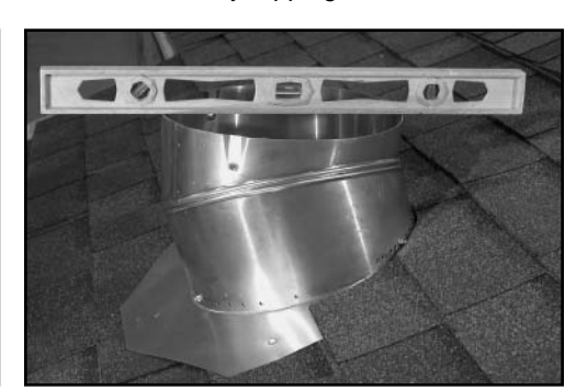
6.Rotate top of elbow to level position by turning counter clockwise.