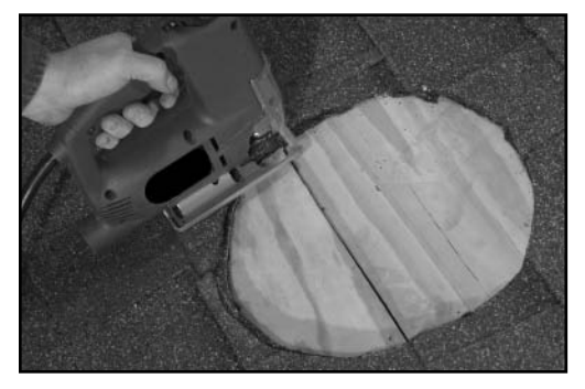
4.Cut hole as marked. Seal around top and sides with roofing cement