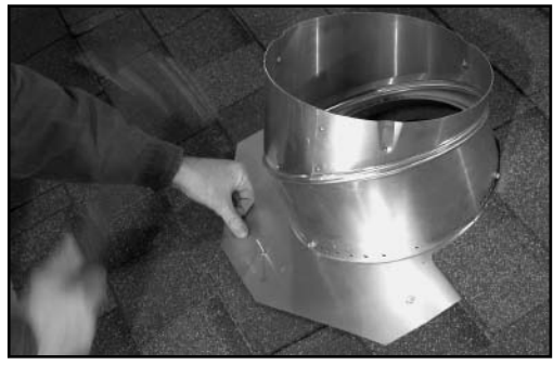
5. Slide top half of flashing under shingles. Secure with nails.