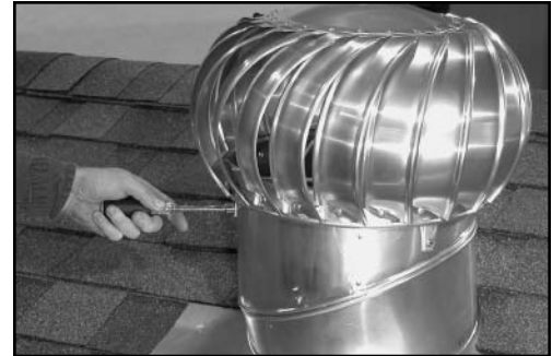
9.Position whirlybird on the base. Line up the predrilled holes in the brackets and base and fasten with long sheet metal screws.